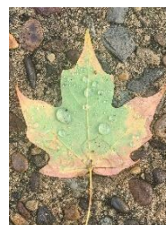
All Trails Lead to One