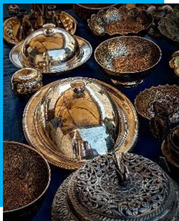
Antique Asian Market