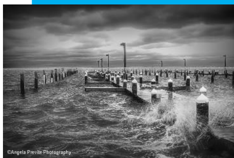
Alone in the Storm